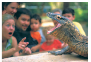
Children enjoy exhibits sponsored by the Foundation at the Houston Zoo.