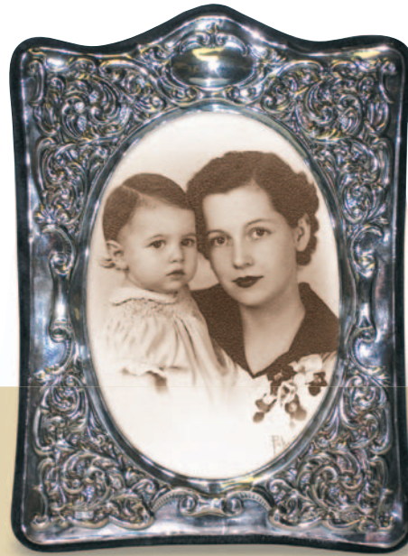
Daughter and mother in 1936.